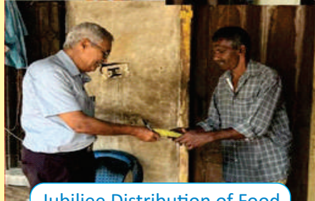
Jubilee Distribution of Food