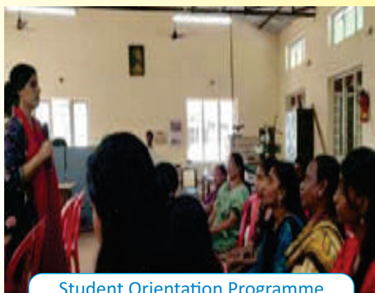
Student Orientation Programme