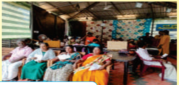
IHDP Community Hall, Karimbuvila, Karakulam