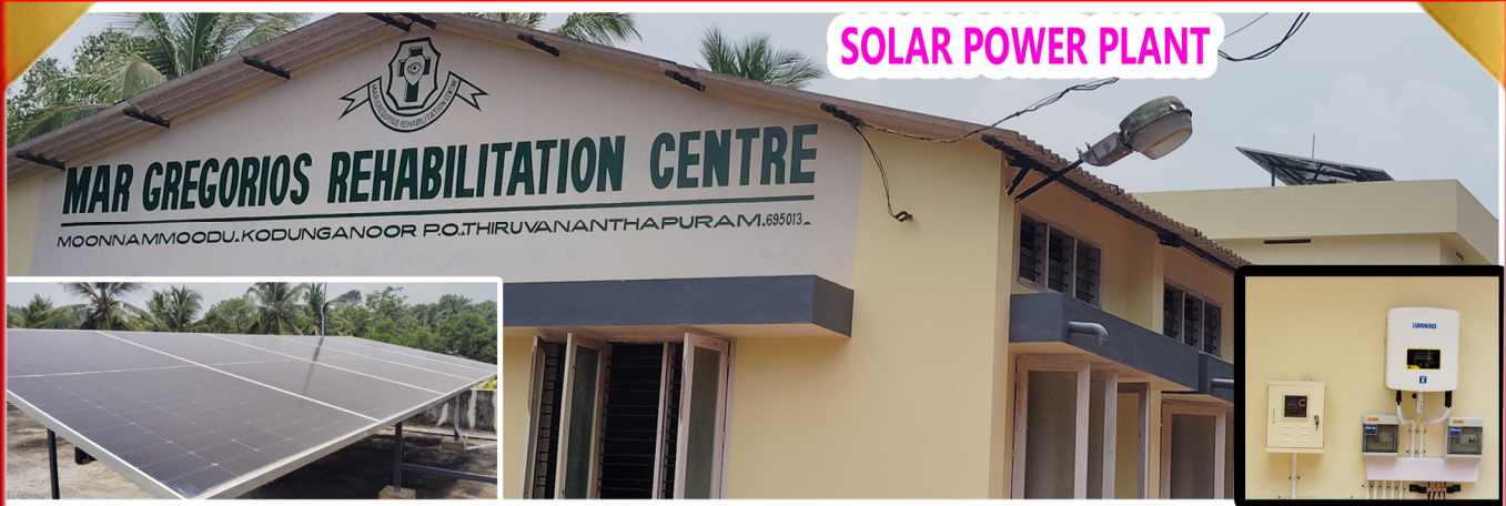
SOLAR POWER PLANT