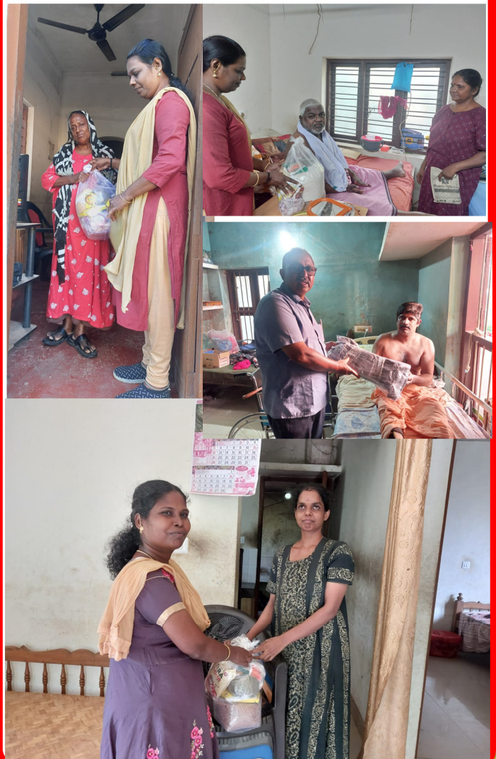
DIABETIC REVIEW DURING JDF DISTRIBUTION